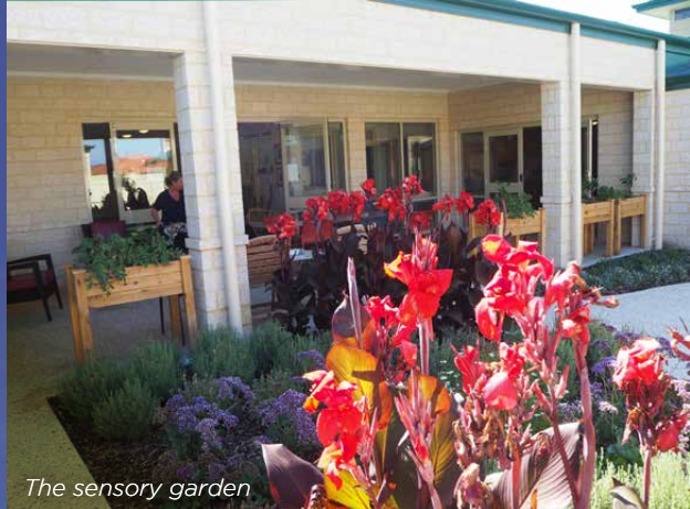
The sensory garden