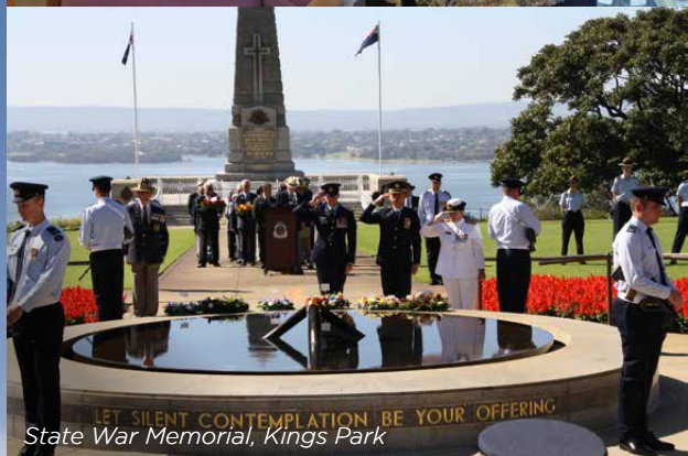
State War Memorial, Kings Park