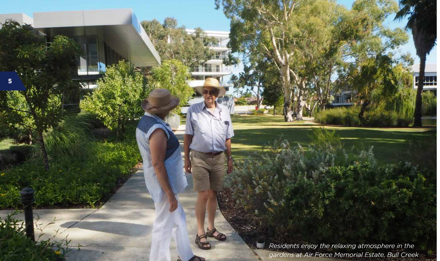
Residents enjoy the relaxing atmosphere in the gardens at Air Force Memorial Estate, Bull Creek