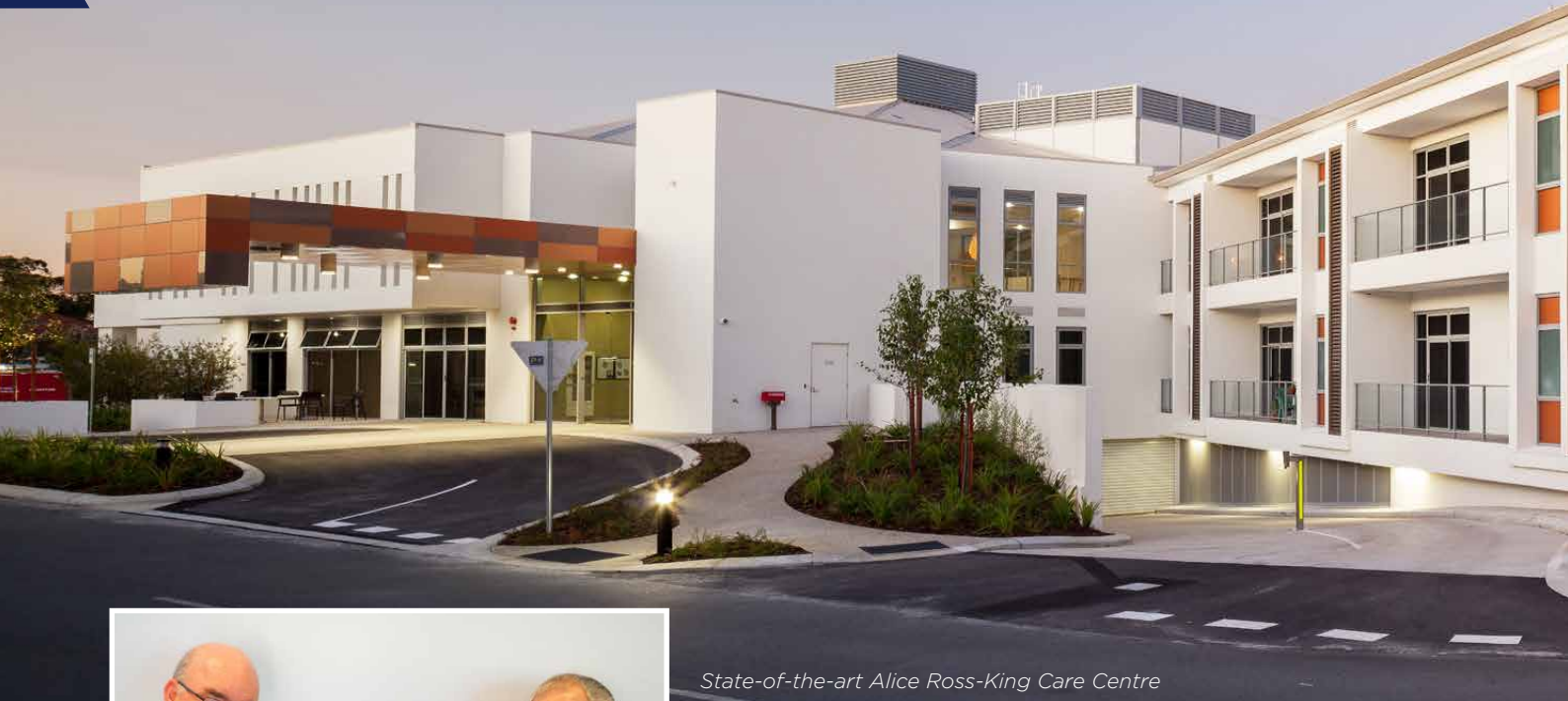
State-of-the-art Alice Ross-King Care Centre